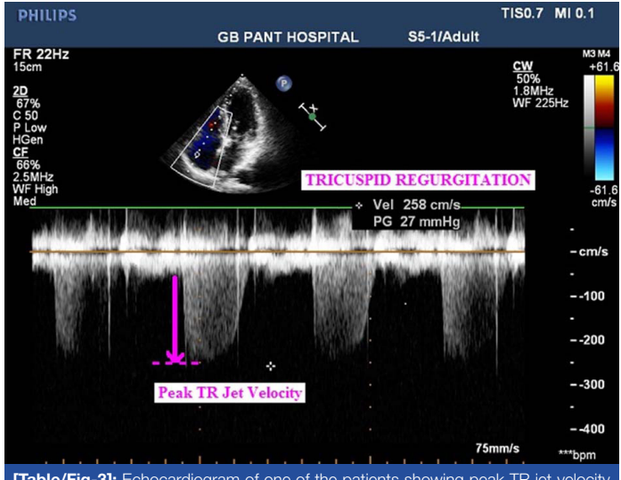
[Table/Fig-3]: Echocardiogram of one of the patients showing peak TR jet velocity (pink arrow) and estimation of pulmonary artery systolic pressure.

(Tricuspid Regurgitation (TR); Pericardial Effusion (PE); dilatation of Right Heart (RH) chambers; reduced Left Ventricular Ejection Fraction (LVEF); Pulmonary Regurgitation (PR)